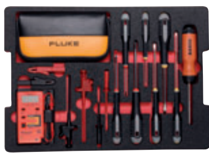
Aviation Tool Box: Tray 2